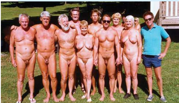
Early NAC/NEF board at Empire Haven.