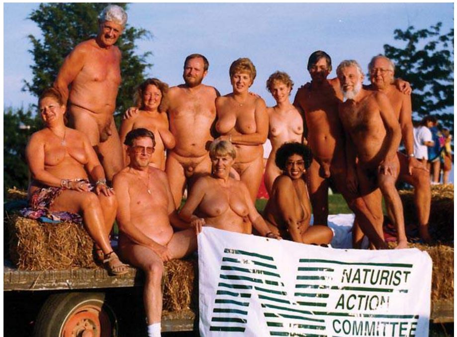
The NAC/NEF board enjoying a hay ride at Turtle Lake Resort in Michigan.

Wanting to know if the acceptance of skinny-dipping among U.S. adults had